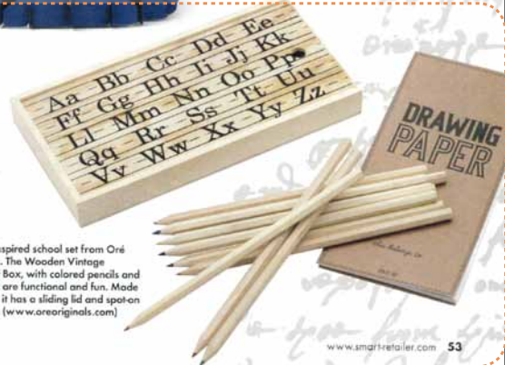
A retro-inspired school set from Oré Originals. The Wooden Vintage Alphabet Box, with colored pencils and notepad, are functional and fun. Made of wood, it has a sliding lid and spot-on graphics. (www.oreoriginals.com)