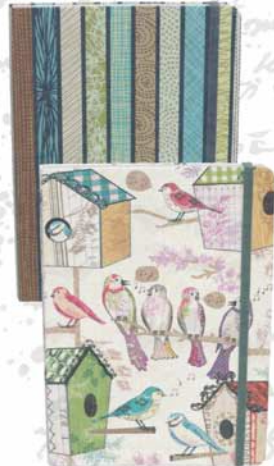
Roger la Borde journals are lovely to look at and delightful to use. They feature 192 blank pages, an elastic binder, and measure 6 by 8.25 inches. Cover choices are sure to appeal to all the customers who frequent your shop. (www.rogerlaborde.com)