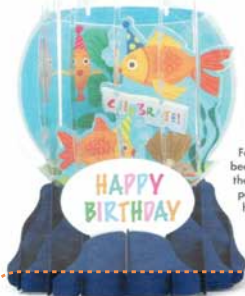
For more than 35 years, Up With Paper has been astounding and delighting customers the world over. Billing itself as "the original pop-up greeting card company," the firm has been making three-dimensional stationery products since 1978. If their designers can dream it, they can construct it. (www.upwithpaper.com)