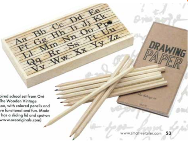
A retro-inspired school set from Oré Originals. The Wooden Vintage Alphabet Box, with colored pencils and notepad, are functional and fun. Made of wood, it has a sliding lid and spot-on graphics. (www.oreoriginals.com)